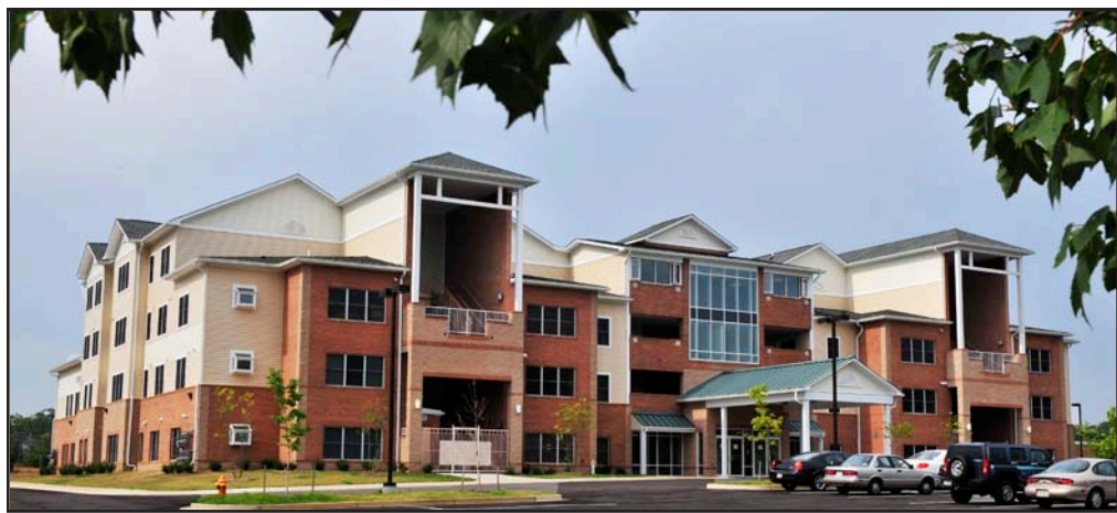
The Gateways community opened this year to provide additional housing opportunities for the county's residents. Located behind Great Mills High School on Lexwood Drive, this 4-story residential building was sponsored by The Housing Authority. It consists of 42 quality, energy efficient homes comprised of one, two and three bedrooms ranging from 774 to 1,190 square feet.

neighborhoods for military residents, Columbia Colony, located behind the Target store in California and Challenger Estates, sited within the Wildewood Residential Subdivision.