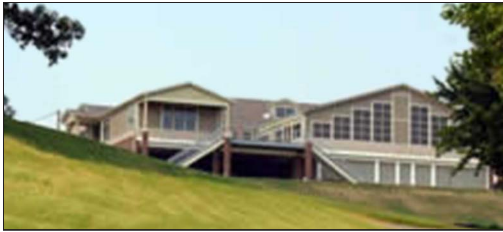
This view of the new Wicomico Clubhouse, located at the Wicomico Shores Golf Course, only tells half the story. The view from inside the clubhouse captures the Wicomico River and the golf course. The clubhouse is now open and features The Riverview Restaurant, an elegant restaurant and banquet facility. The new Clubhouse features over 14,000 s.f. of space, including an expanded golf pro shop, indoor space for carts, office spaces, and an elegant restaurant and bar and grill services.

runners, bikers and rollerbladers. This project is continuing to attract significant state and federal grants.