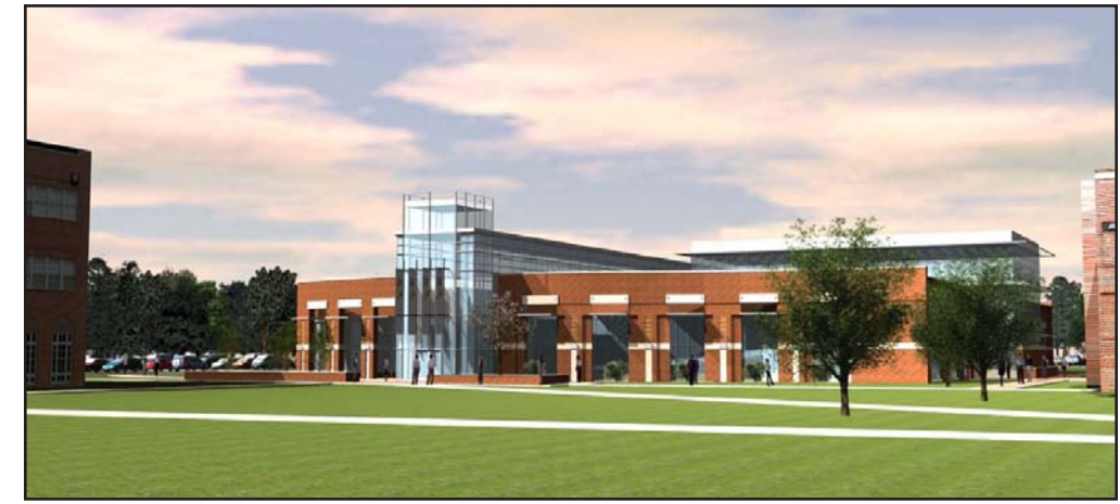
This artist's rendering of the new Wellness Center on the College of Southern Maryland Leonardtown Campus in Leonardtown depicts a state-of-the-art facility needed for our community and our community college. Planned to open in January 2010, the building will be home to two swimming pools, a variety of classroom spaces for aerobics, yoga and other fitness activities.

The prevention of encroachment around the Naval Air Station remains a key priority for the County Commissioners. Per the Memorandum of Understanding that was signed in April 2007 to formally confirm the partnership required to prevent future