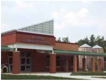
Evergreen Elementary School, the county's newest elementary school, earned a Silver LEED certification and is integrating energy conservation into the daily curriculum for the students.