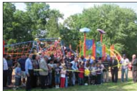
County Commissioners join residents from Carver Heights to celebrate the addition of the new playground at Carver Heights Park in June.

--Significantly upgraded the County's geographic information system (GIS), an electronic mapping tool used by county residents, businesses, public safety agencies, and other entities for research, planning and construction activities.