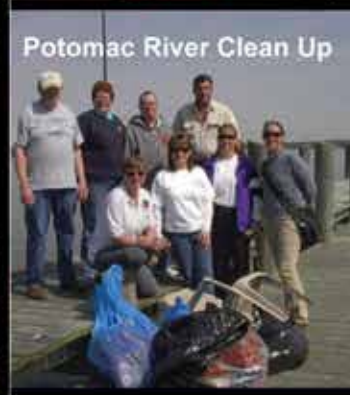
Potomac River Clean Up