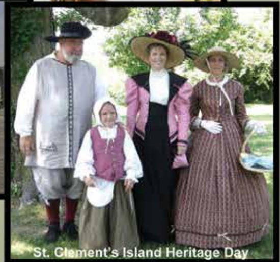
St. Clement's Island Heritage Day