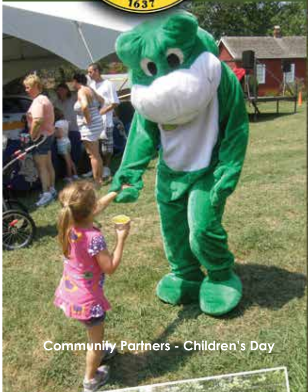
Community Partners - Children's Day