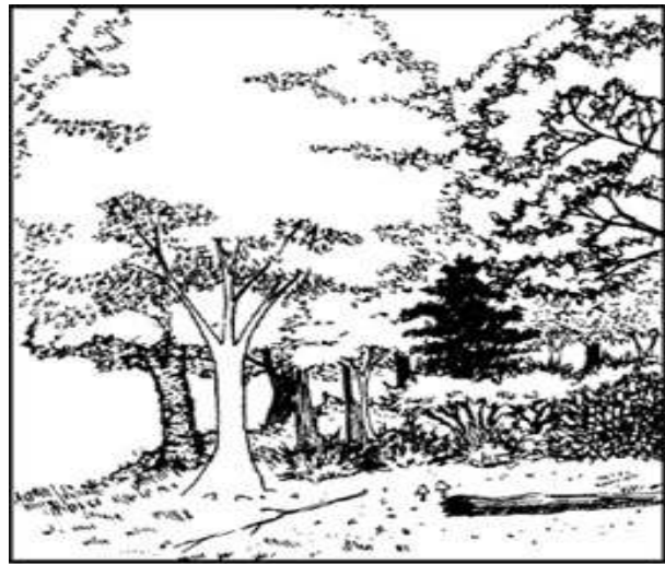
Most effective configuration